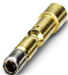
Crimp contact, Wire spring, Single contact, Contact diameter: 1 mm, Crimp range: 0.14 mm 2 ...1 mm 2

Please be informed that the data shown in this PDF Document is generated from our Online Catalog. Please find the complete data in the user's documentation. Our General Terms of Use for Downloads are valid ( http://download.phoenixcontact.com )